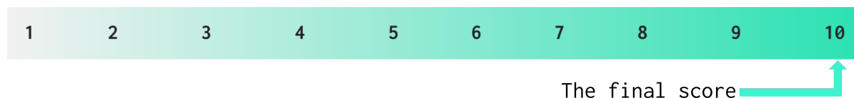
Table. The distribution of issues during the audit

According to the assessment, the Customer's smart contract has the following score: 10.0 . The system users should acknowledge all the risks summed up in the risks section of the report.